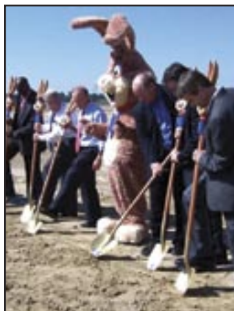
Madison County - Local and state officials join Quicky, the Nesquik Bunny and officials from Nestlé at the ground breaking ceremony for the company's $359 million factory and distribution center.