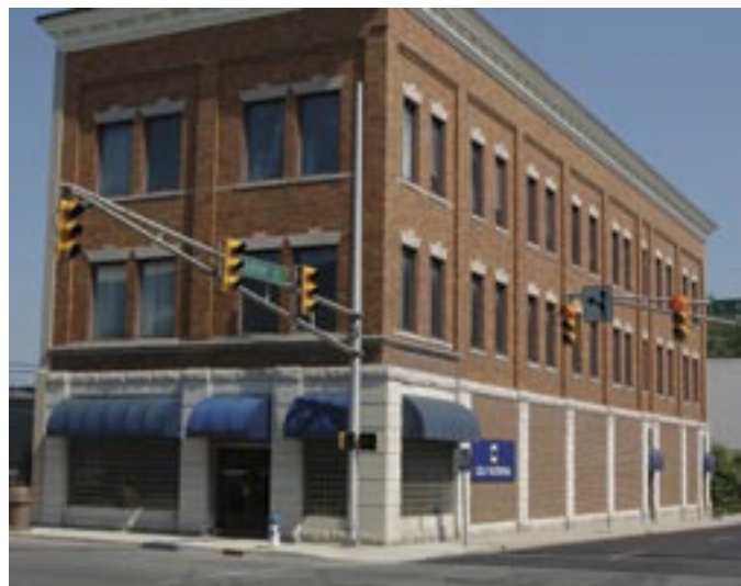
Energize-ECI Engagement Center, 122 E. Main St., in the heart of downtown Muncie.