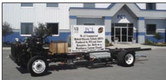
Randolph County - Prototype of a hybrid electric vehicle (HEV) for the step van and shuttle bus industries. The vehicle is being developed as a joint venture between PCI of Union City and Azore Dynamics in Canada. This project has the potential to create 200 jobs over the next 24 months.