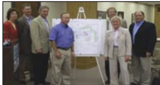
Governor Mitch Daniels and representatives from Petoskey Plastics at the press conference announcing the company's plans to open a plant in Hartford City.

Energize-ECI provides a central point of facilitation for regional economic development efforts, focusing on enhancing regional communities; pro-active business development; workforce issues; federal grants for business and education; enhancing in-state collaboration; regional promotion and development efforts.