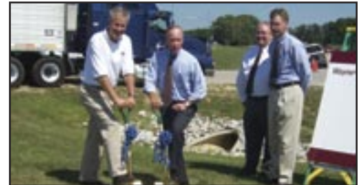
Executives from Dot Foods, Inc. join with Governor Mitch Daniels at the groundbreaking ceremony for Dot's new food distribution center in Wayne County.