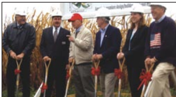
Randolph County - Ground breaking ceremony for Cardinal Ethanol's $150 million plant, which will employ 45. The ownership is unique in that over 1,000 individual investors are involved.